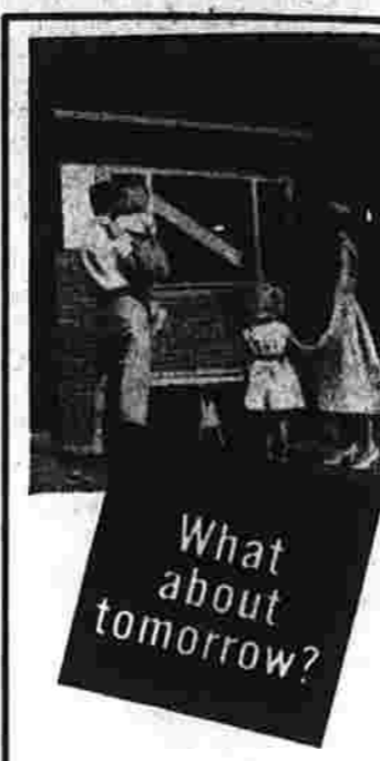
What about tomorrow?

Today they watch excitedly as their new home takes shape. Tomorrow they will start their new life. There will be new friends, schools, and various organizations as they become part of the community. To children growing up, their neighborhood becomes their whole world. What if something were to happen to you? Would you not want your family to remain in familiar surroundings? Sun Life's Mortgage Protection Policy can safeguard your home for those you love. It's a policy well worth investigating. May I discuss it with you?