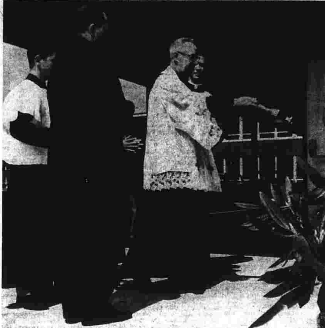
Cornerstone in at East Catholic High

Manchester Cadettes will meet tonight at 7:30 in the Federation Room at Center Congregational Church for a final meeting before the summer recess. Refreshments will be served.